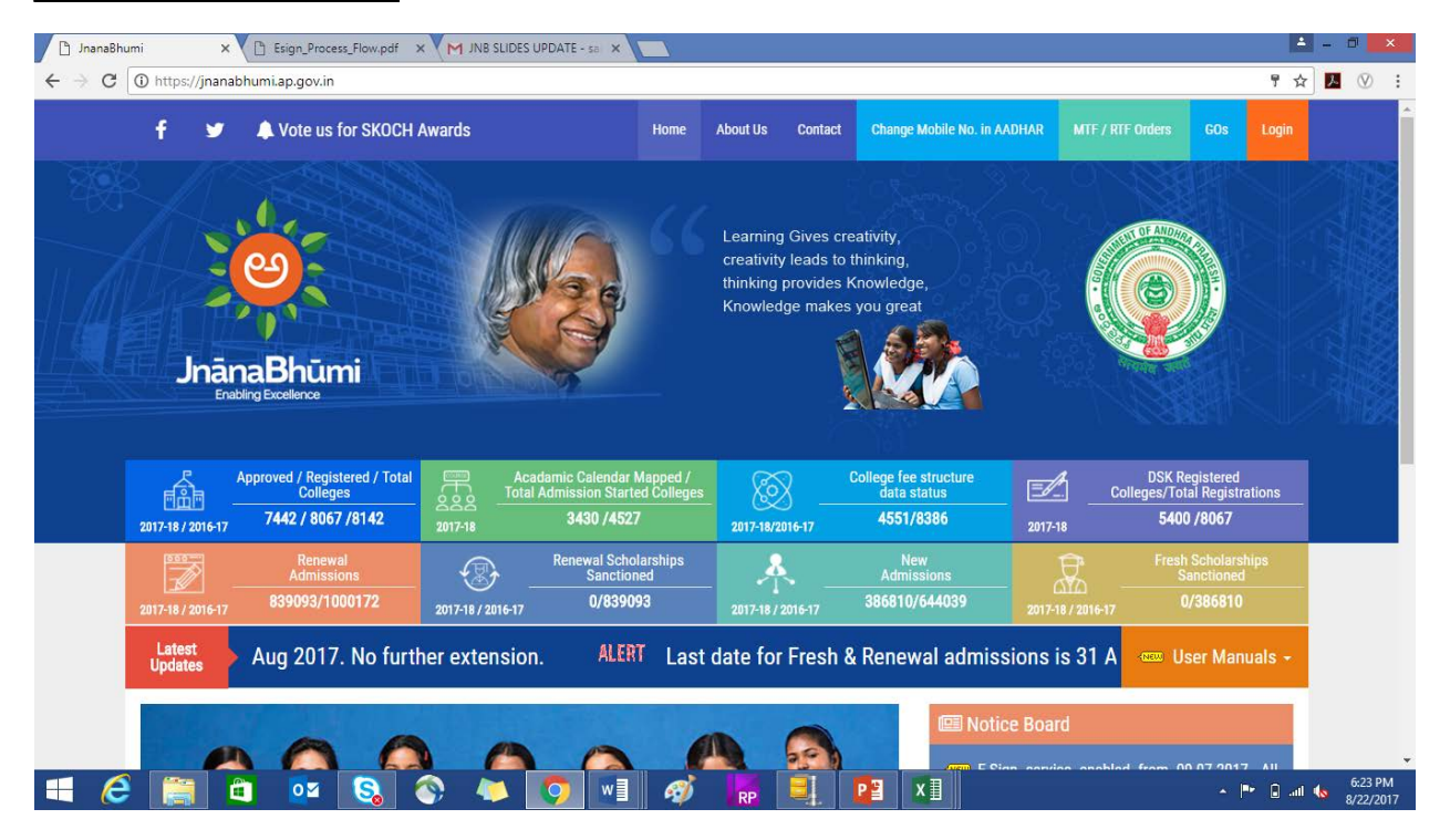
Figure 1 Home Page